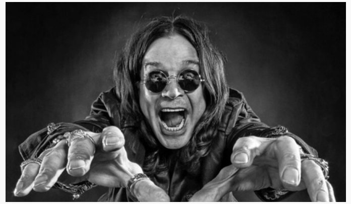
Ozzy Osbourne

In the final verse, Osbourne sings, “Day of judgement, God is calling / On their knees the war pigs crawling / Begging mercy for their sins / Satan’s laughing, spread his wings / Oh lord, yeah!”