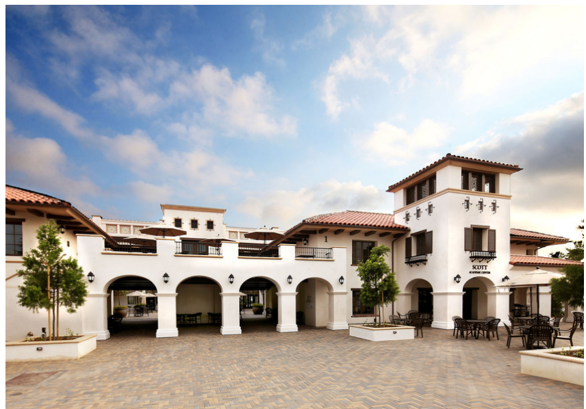
A brilliant sunset over Scott Academic Center, Vanguard University.