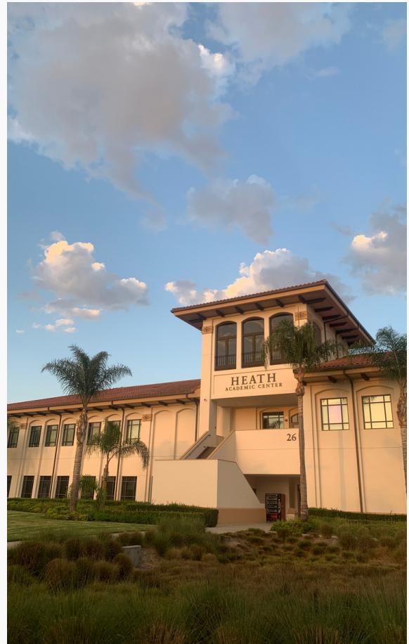
Heath Academic Center